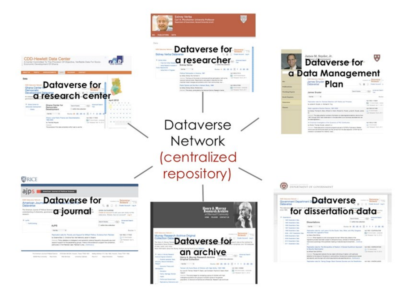
Figure 2: A Dataverse Network offers a centralized data repository. Each dataverse hosted is owned and customized by the data owner or provider.

Employing these two standards, a third party can reuse the data that build scientific knowledge, thus reexamining and validating, but most importantly, advancing science.