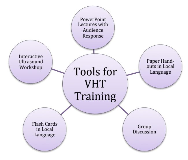
Figure 3. Tools for VHT training.

In July 2015, the ITW program evaluated the effectiveness of the VHT "train the trainer" program. In conjunction with the rollout of an echocardiography program at the health centers to detect rheumatic heart disease in pregnancy, 30 VHT members were tested on their knowledge of streptococcal infection, acute