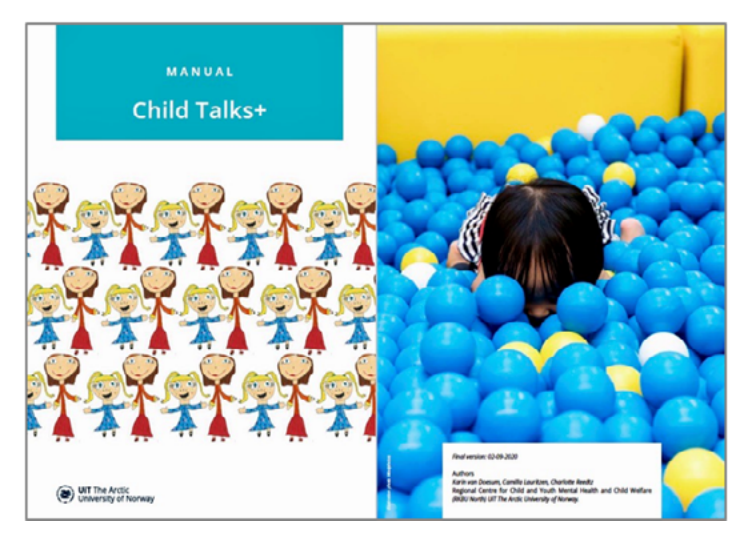
The <u>manual for Child Talks +</u> is available for free on the website of RKBU-Nord [website in Norwegian language] . (https://uit.no/prosjekter/prosjekt?p_document_id=349400).